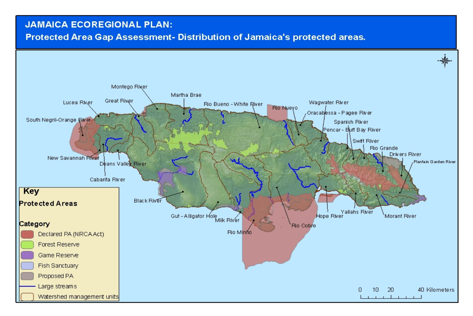
Figure 1: Overlay of Jamaica's Protected area and major freshwater systems